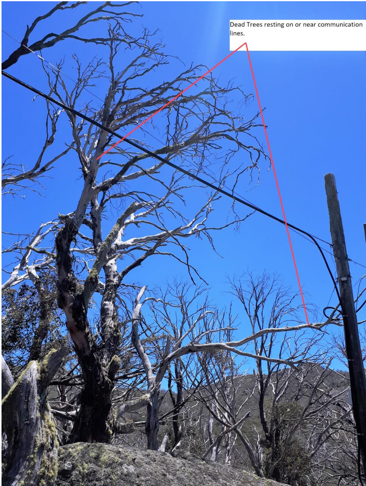
On the Western end of Cooma Lodge. 2 dead trees resting on or near communication lines are deemed a hazard and are permitted to be removed.